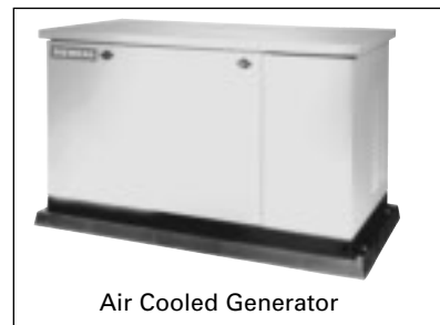
Air Cooled Generator