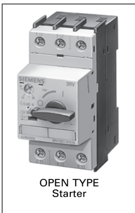
OPEN TYPE Starter