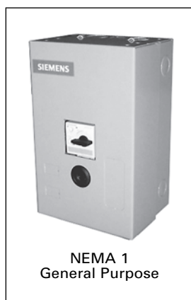
NEMA 1 General Purpose