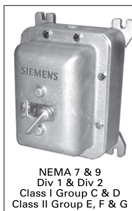
NEMA 7 & 9 Div 1 & Div 2 Class I Group C & D Class II Group E, F & G